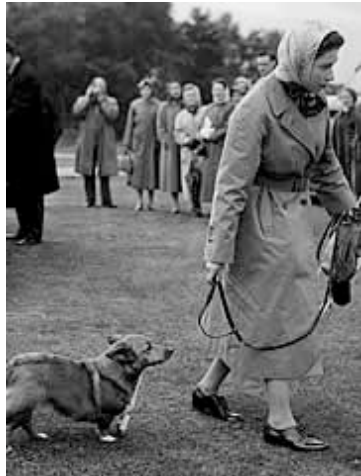
An 18th birthday gift from Elizabeth's parents, Susan held a particularly special place in the princess' heart